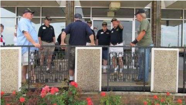
Start of tour of USS Alabama