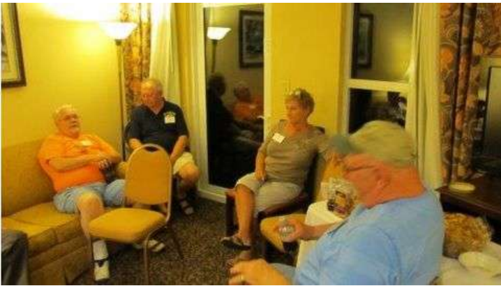
DDG-10 Hospitality Room at the Hampton Inn