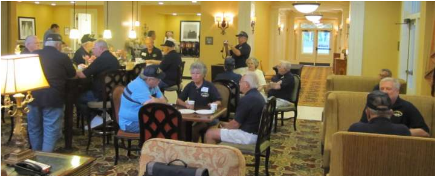
Breakfast at the Hampton Inn