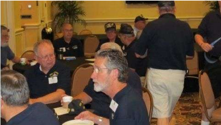
DDG-10 Association formal meeting